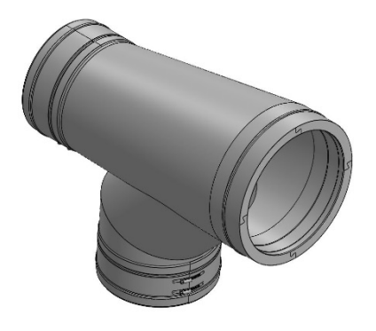
Increasing Boot Tee